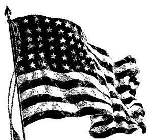
Remember to Fly Your Flag September 11th