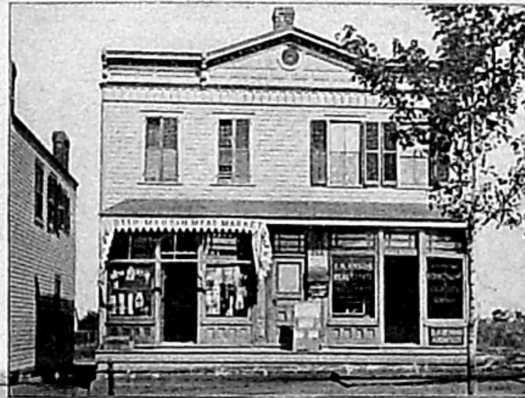
HASBROUCK HEIGHTS OFFICE OF THE LEMMERMANN VILLA SITE COMPANY.