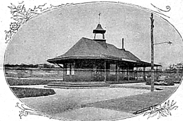
STATION AT HASBROUCK HEIGHTS, N. J.